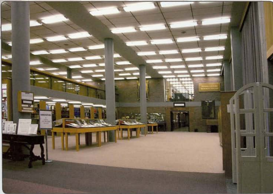
Retrofit - Before